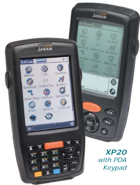
XP30 with Numeric Keypad

The XP30 is the world's first fully-featured mobile computer that scans barcodes and runs the latest version of the Palm OS. A brilliant, color, quarter-VGA display and blazing Freescale™ architecture make the XP30 a best-of-breed, rugged, barcode scanning, mobile computer, while its list price makes it impossible to ignore. For customers who want to extend the reach and capability of their mobile Palm applications, the XP30 has the horsepower to execute mission-critical data collection tasks at the point of business activity. And for customers who are ready to switch to the Palm OS for its simplicity and its durability, the XP30 is a platform that pays for itself twice as fast as comparable devices.