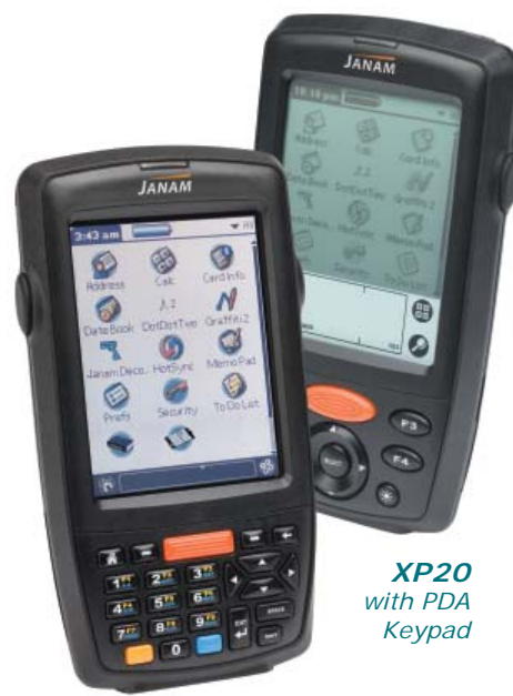
XP20 with PDA Keypad

The XP30 is the world's first fully-featured mobile computer that scans barcodes and runs the latest version of the Palm OS. A brilliant, color, quarter-VGA display and blazing Freescale™ architecture make the XP30 a best-of-breed, rugged, barcode scanning, mobile computer, while its list price makes it impossible to ignore. For customers who want to extend the reach and capability of their mobile Palm applications, the XP30 has the horsepower to execute mission-critical data collection tasks at the point of business activity. And for customers who are ready to switch to the Palm OS for its simplicity and its durability, the XP30 is a platform that pays for itself twice as fast as comparable devices.